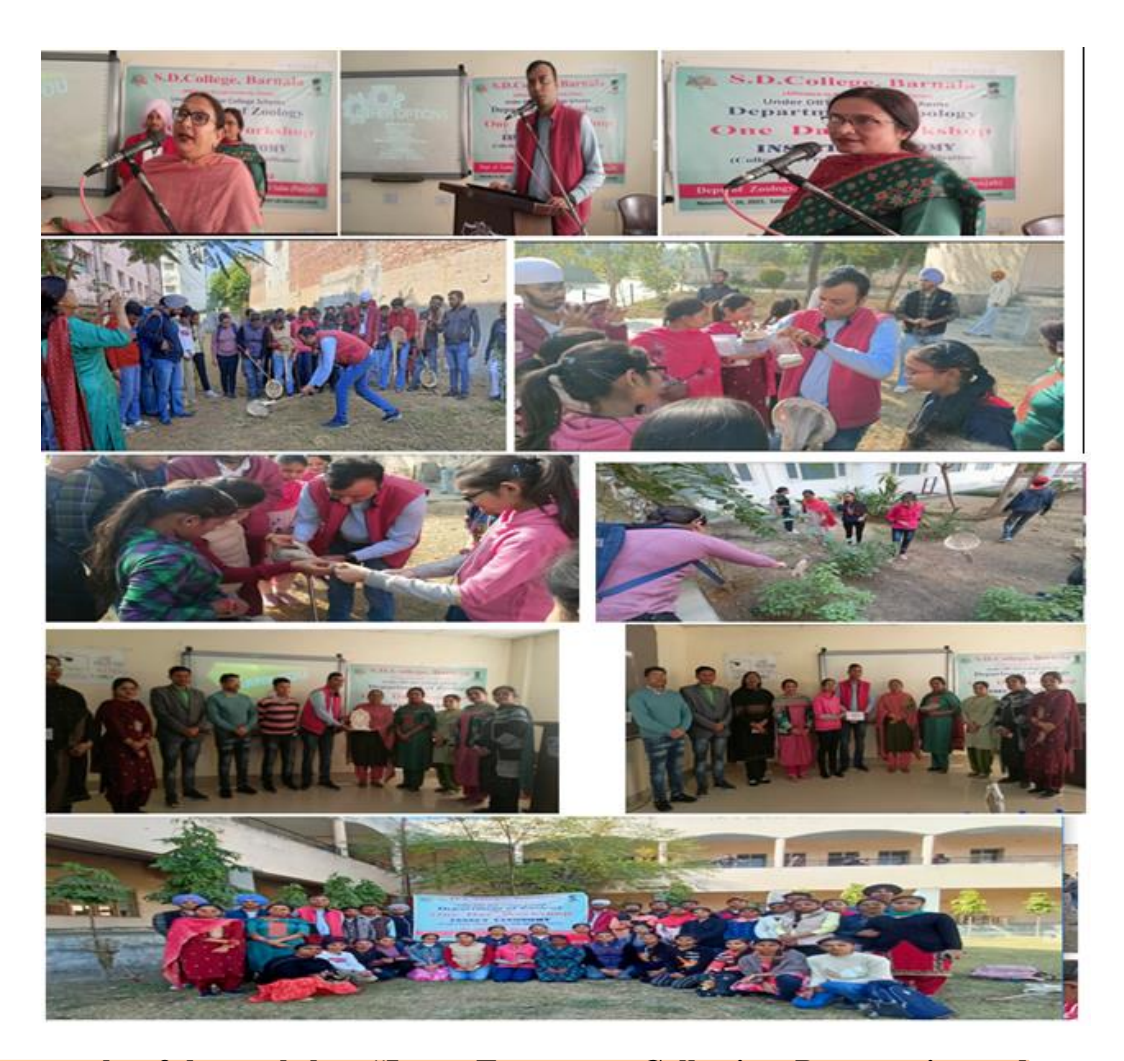
Photographs of the workshop "Insect Taxonomy: Collection, Preservation and Identification" (26th November, 2022)

S.D. College, Barnala Department of Zoology Report on Workshop "DNA Isolation, Electrophoresis and Immunological Techniques" (6<sup>th</sup> Feb, 2023)