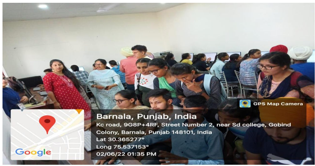
Some photographs of the workshop "ChemSketch" (June 2, 2022)