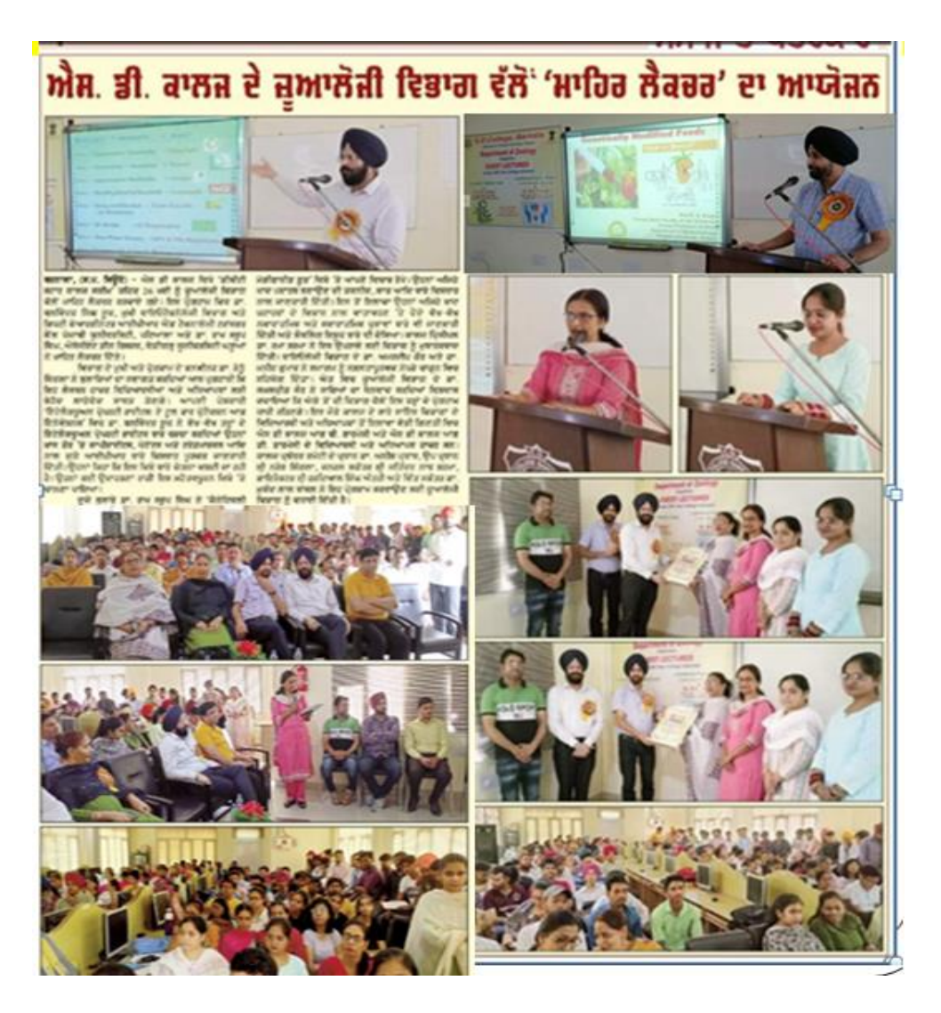
Some photographs and News Cutting of the lectures (26 May, 2022) a) Intellectual Property Rights-A Tool for Protection of Innovations b) Genetically modified Foods"

S.D. College, Barnala Department of Chemistry Report on Workshop Chemistry Software "ChemSketch" (June 2, 2022)