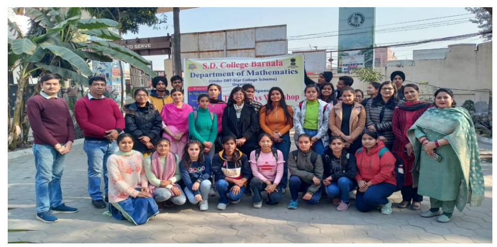
Photographs of the workshop on software 'MATLAB' from 2<sup>nd</sup> Feb. to 4<sup>th</sup> Feb. 2023

S.D. College, Barnala Department Of Chemistry Report on Workshop "Lab Safety Measures" (13<sup>th</sup> Feb. 2023)